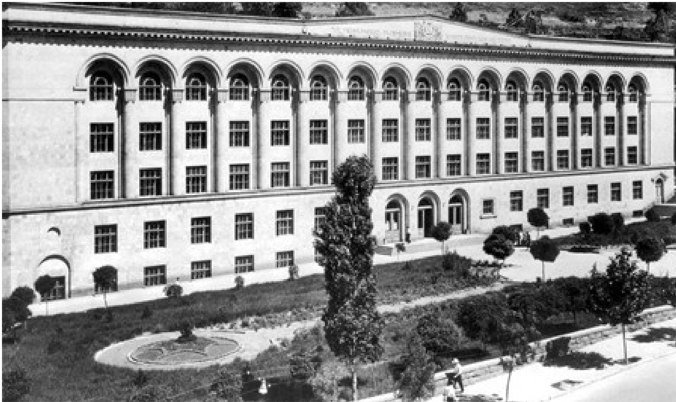
Yerevan Polytechnic Institute